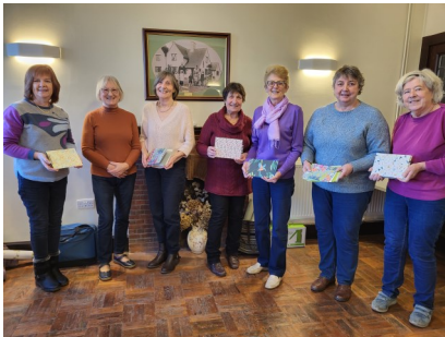
The Scrapbookers with their work